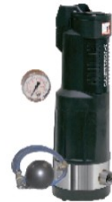
Possible mounting setups

Installation: in the tank Automatic switch to city water: no Flow rate: up to 5,7 m 3 /h Maximum suction depth: 48 meter